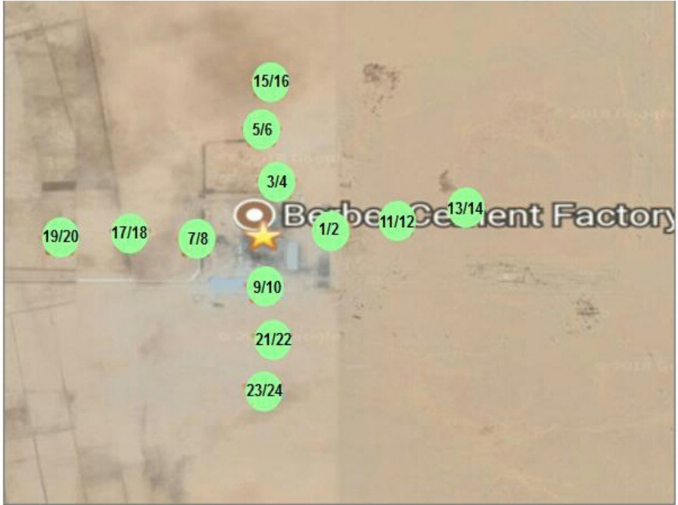
Fig: 1 The study and sampling area (Asmaa Elrasheed 2022 )

road. Temperature in the study area during the collection of samples were between 29°C and 31°C. (Figure 1) described the study area and sampling.